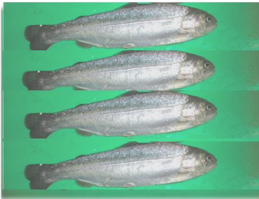
Family 1: Uniform